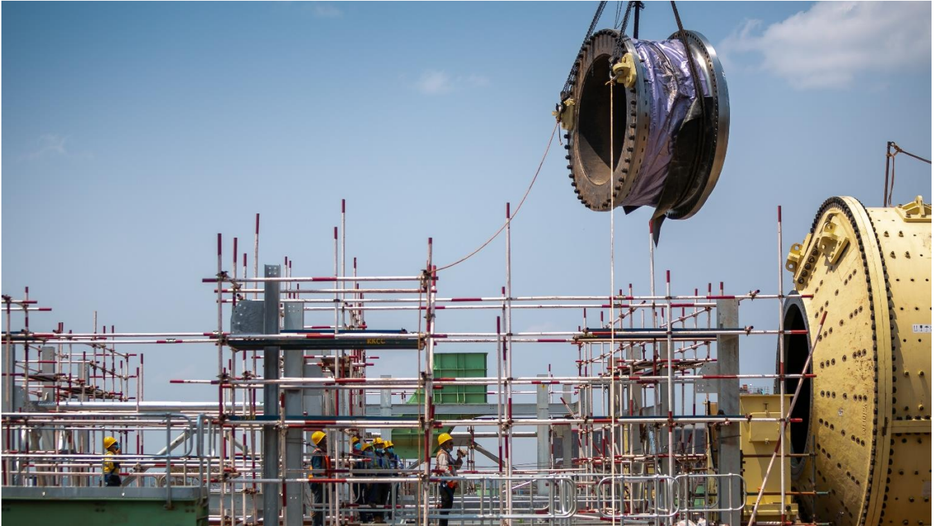
Lifting the reducer gear box assembly for the Phase 2 secondary ball mill.