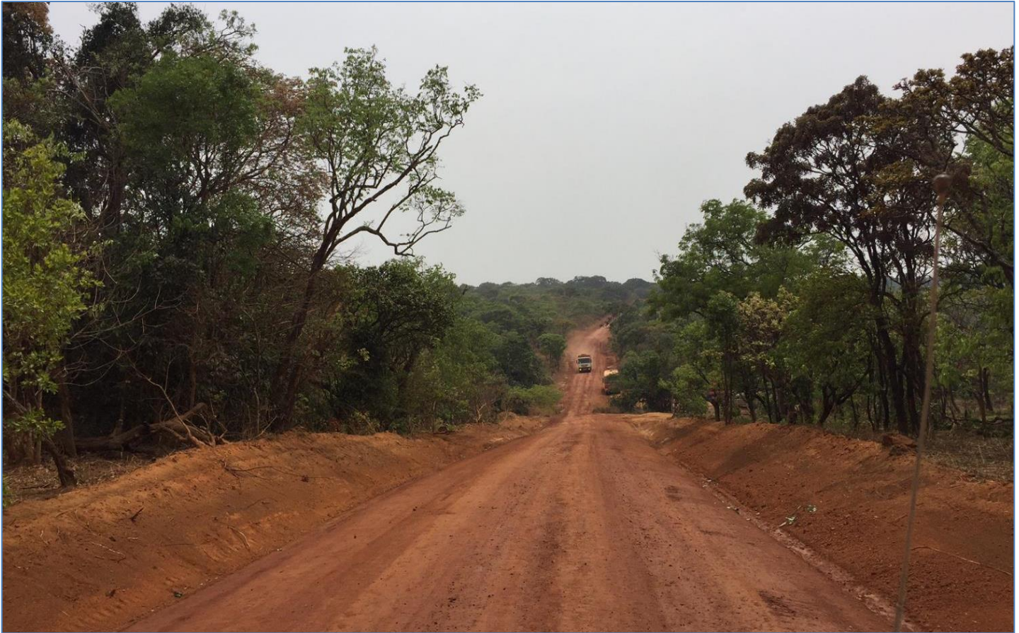
Figure 7. The new Kakula access road under construction.