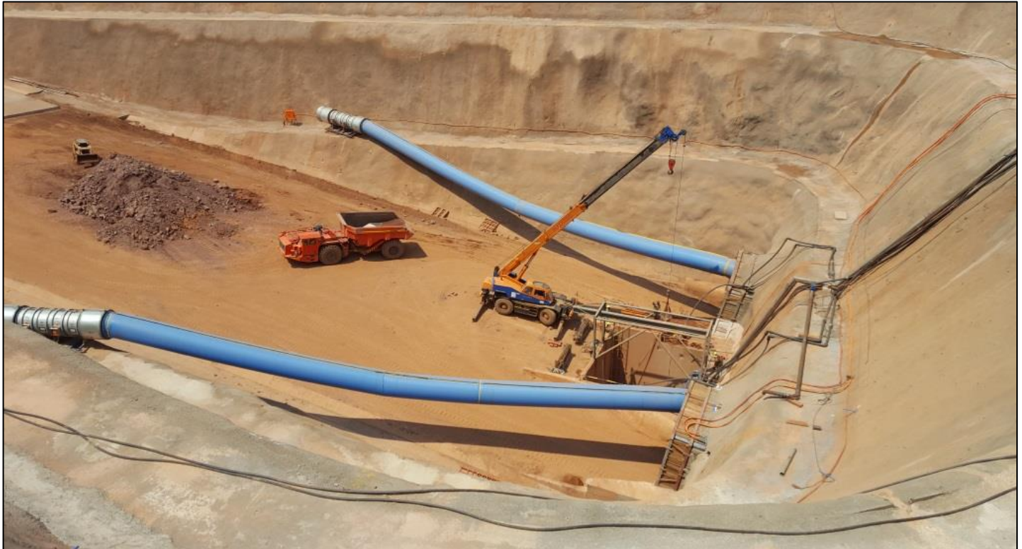
Figure 5. Kansoko box-cut sump being cleaned and equipped.

Development of the underground mine is designed to reach the high-grade copper mineralization at the Kansoko Sud deposit during the first quarter of 2017. The development is ahead of schedule and within budgeted costs.