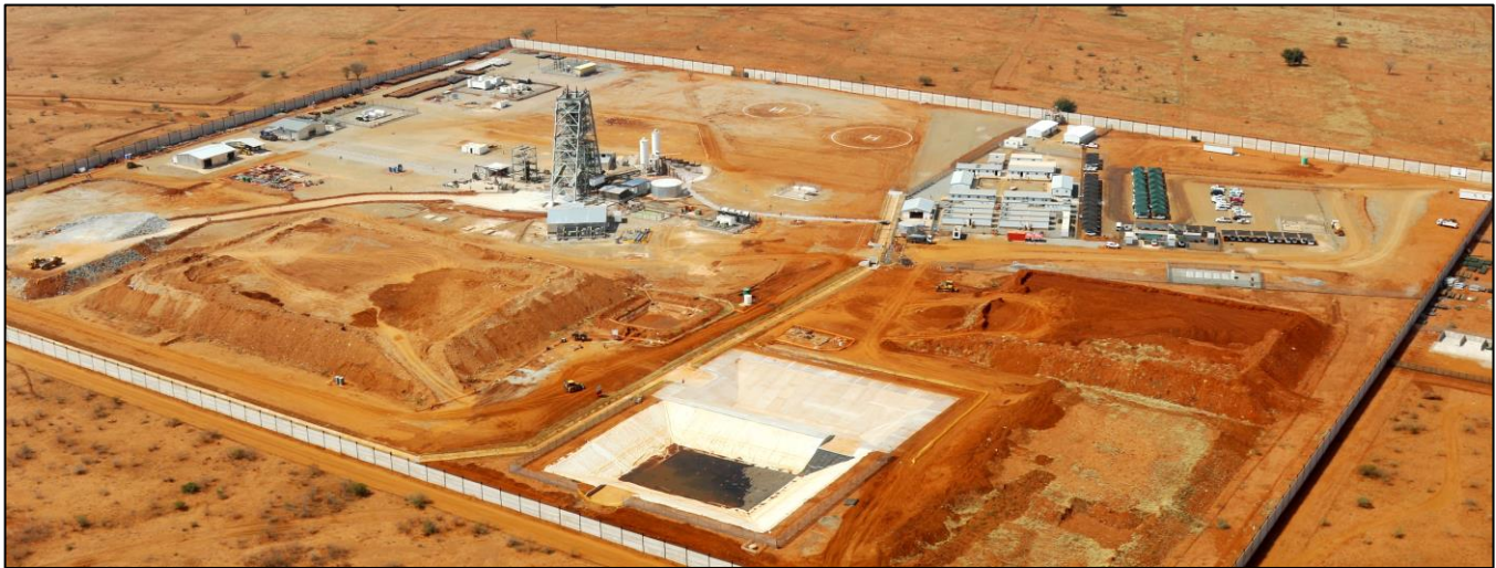
Figure 1. Shaft 1 headgear and other related surface infrastructure.

A sinking rate of 45 metres per month is expected during the main phase, which includes a 300-millimetre concrete shaft lining and inserts. The current level is approximately 130 metres below surface; stations will be developed at the 450-, 750-, 850- and 950-metre levels. The main sinking phase is expected to reach its projected, final depth of 980 metres below surface in 2018.