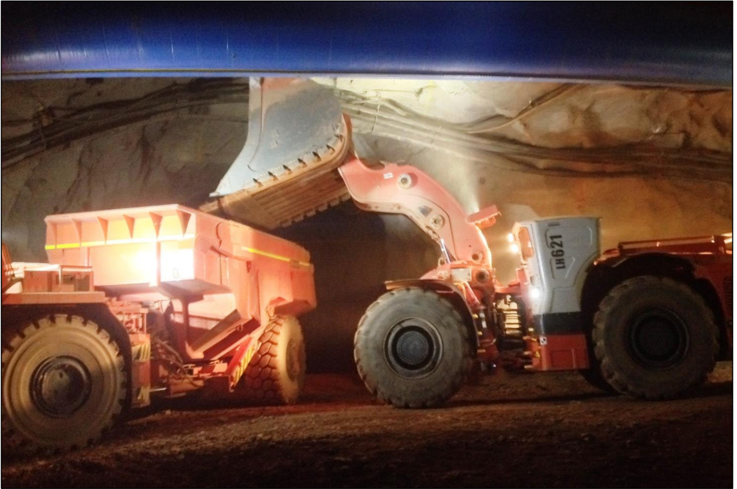
Figure 6. Underground loading operation.

In parallel with the Kamoia 2016 PFS, an alternative mining method – controlled-convergence room-and-pillar mining, developed by Poland-based KGHM – was investigated for potential use on the Kansoko deposits. Given the thick, mineralized widths encountered to date in the Kakula drilling program, controlled-convergence room-and-pillar mining also will be investigated for potential use at Kakula.