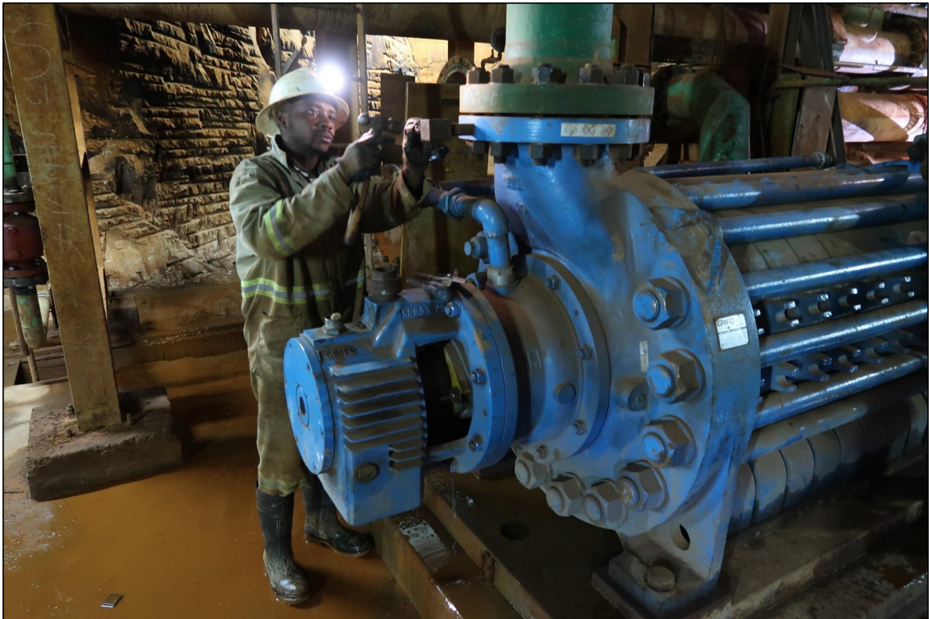
Figure 3. Connecting discharge pipes to one of five pumps on the 1,200-metre-level.

Since completion of the drilling program, water levels have been lowered to approximately the 1,245-metre-level in Shaft 5. Engineering work has focused on upgrading of Shaft 5 conveyances and infrastructure, cleaning the shaft bottom to facilitate the installation of new hoist ropes, repairs and upgrades to the hoisting infrastructure and cleaning and stripping of the main pump station at the 1,200-metre-level.