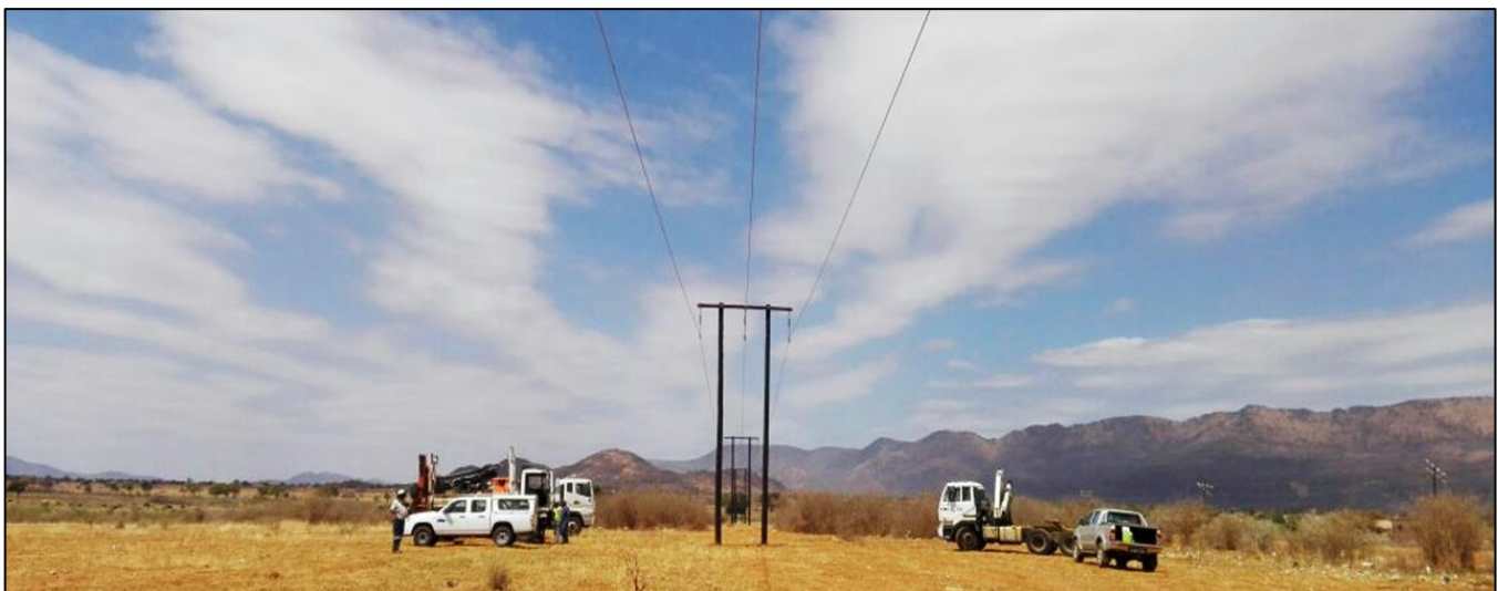
Figure 2. Eskom's 5MVA line to Platreef Project.

Work is complete on the internal substation, which has a capacity of five million volt-amperes (MVA). Construction is underway on the power transmission lines from Eskom, South Africa's public electricity utility, which are expected to supply the electricity for shaft sinking. Back-up generators have been installed to ensure continued sinking operations during any interruptions in Eskom's supply of electricity. The new transmission lines also are expected to provide power to an adjacent community near the Platreef Project, which will be a major, added community benefit.