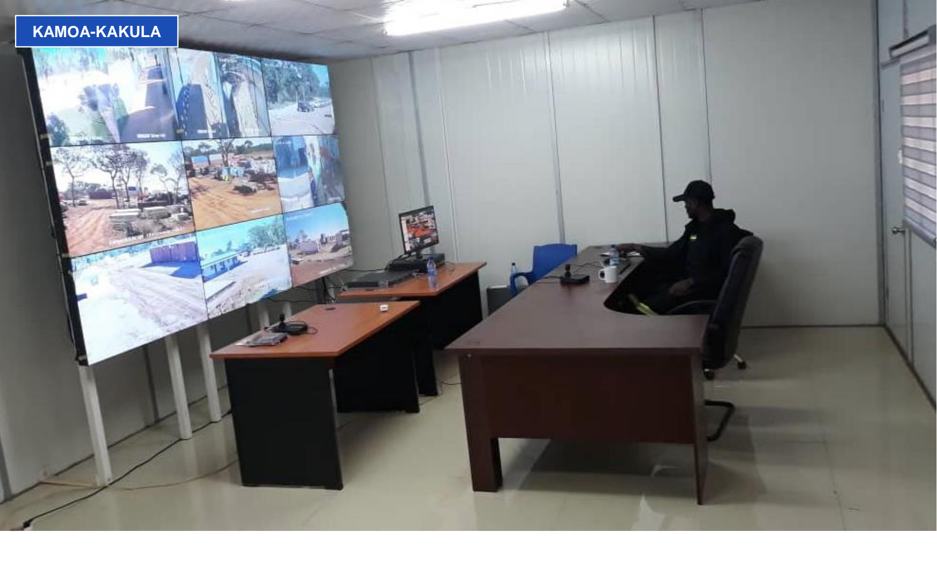
Kakula's newly commissioned security control room.